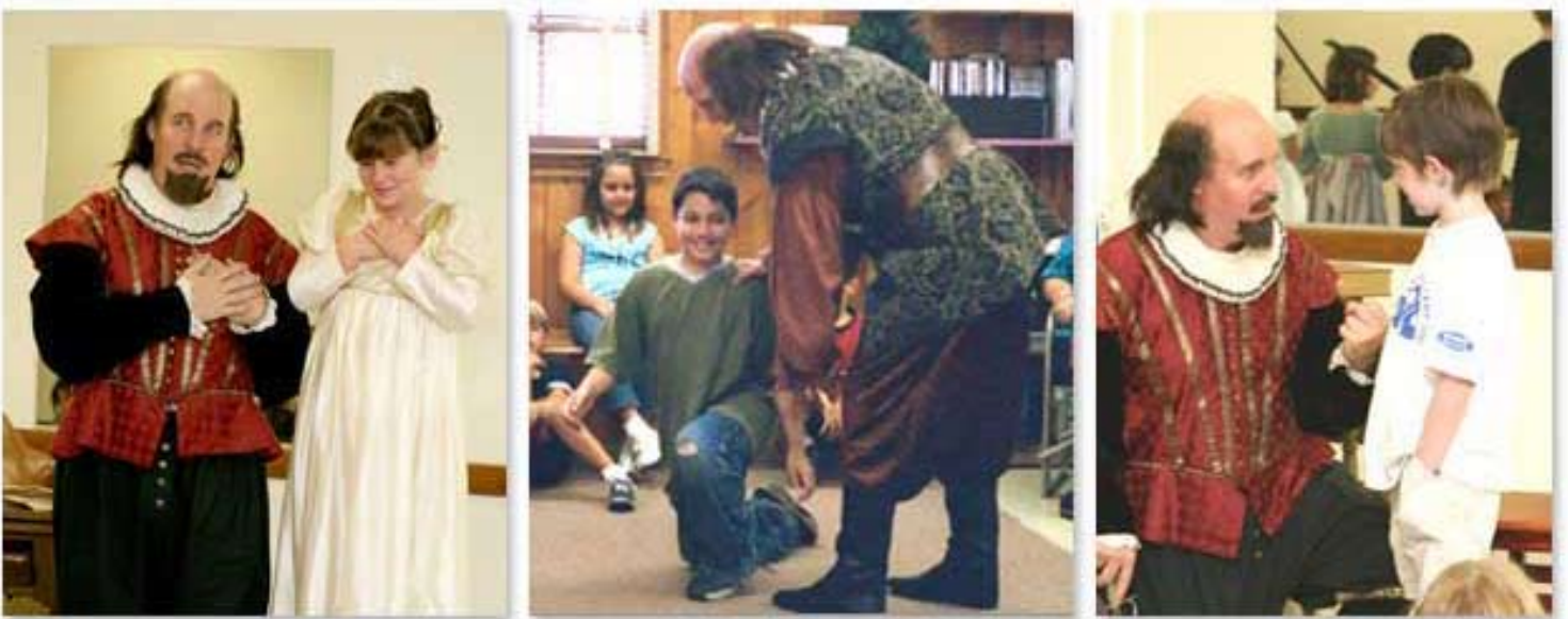
Shakespeare pays a visit to a local school.

A classically trained actor/teacher creates an intimate historical setting of Shakespeare at his writing desk surrounded by the children and the tools of his trade. Shakespeare himself uses puppets of Elizabeth I, James II, the skull of Yorick, Crab the Dog and many other props, plus changes of costume to play the most famous of Shakespeare's characters. All performances are done in a classroom setting and use many of the young students as a part of his creative process.